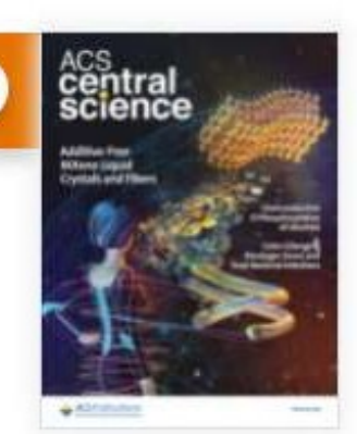
ACS Central Science